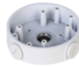
PFA139 Junction Box